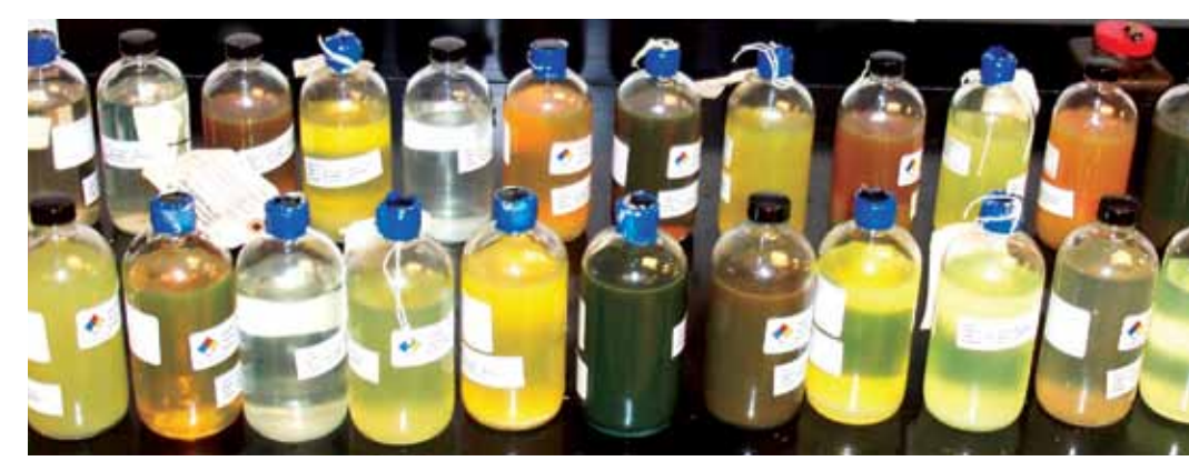
Corpus Christi - The widely varying characteristics of Eagle Ford crude pose a processing challenge for many South Texas refineries.

FHR, for example, wants to enable its Corpus Christi refinery complex to handle the different grades of crude produced from Eagle Ford. That effort is likely to cost hundreds of millions of dollars.